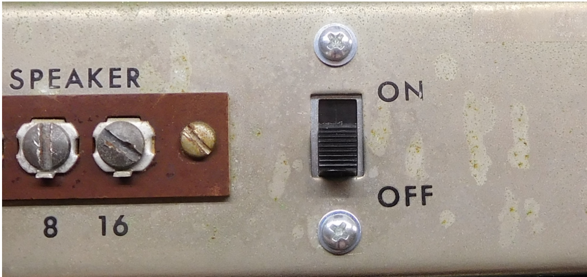
Figure 2-Installed new power switch

Solder the two wires that you marked earlier to their respective terminals. Assuming you installed the switch in the correct orientation, its operation will match the silk screen marked on the chassis.