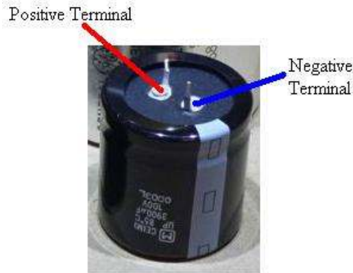
Figure 2-Identifying the positive and negative terminals

Be careful about the capacitor polarity! Check it twice, then check it again. If you get this wrong, the capacitor will be damaged, throwing hot aluminum foil with impressive force. The negative signs on the capacitor mark the negative terminal.