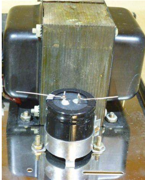
Figure 4 – solder “antenna-like” wires to terminals of C11 to facilitate the connection of the power supply and amplifier wires.