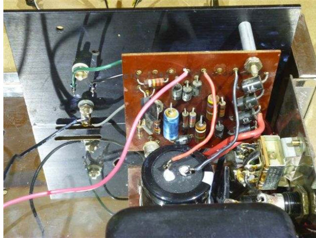
Figure 3-showing the new C9 installed.